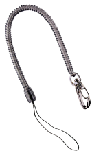
A42001-9 Clip-on Coil Lanyard