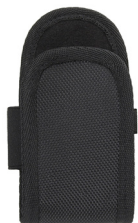
A41014-7 Universal Safety Knife Fabric Holster