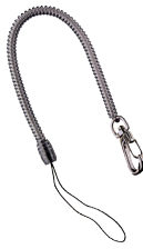
A42001-9 Clip-on Coil Lanyard