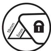
2 locked cutting depth options