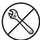
easy, no-tool blade change